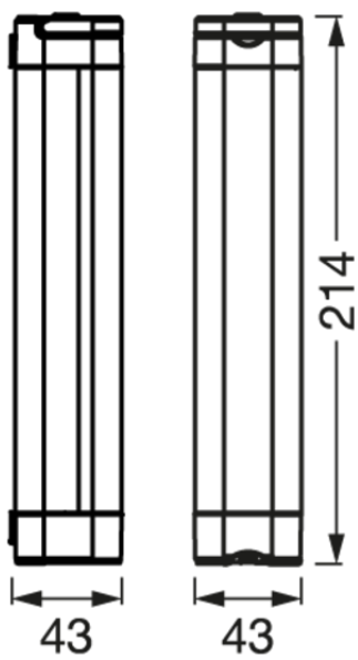
PGLINEAR LED TASK LIGHT 200MM IP54 WTMiPRCmnk